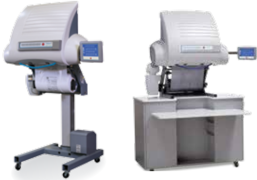
19-INCH FLOOR MODEL