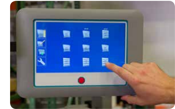
Industrial Grade Touch Screen Display